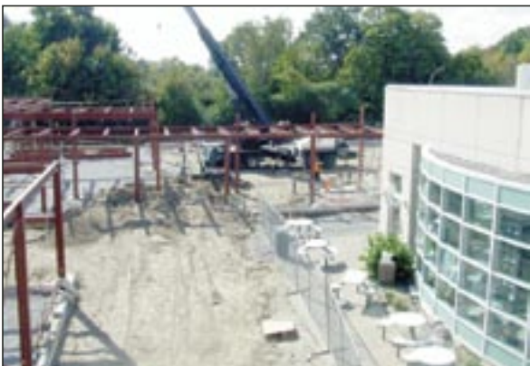
Birthing and Newborn Centre at Rouge Valley Centenary