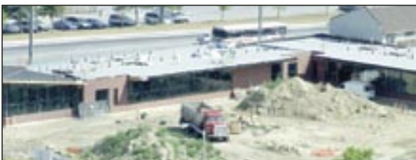
Phase II Mental Health Supportive Housing at Rouge Valley Centenary

More detailed descriptions of each project are available on our website at www.rougevalley.ca