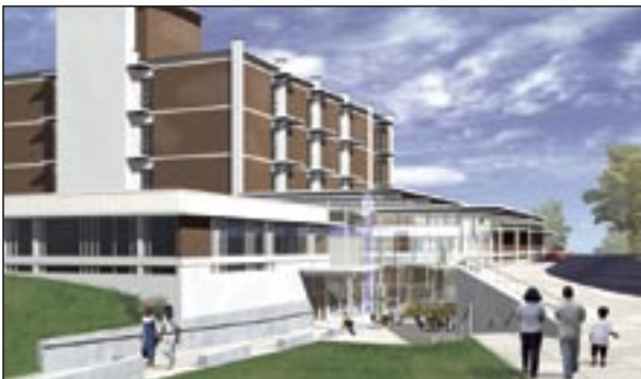
Redevelopment of Rouge Valley Ajax and Pickering—easily the largest of the three projects.