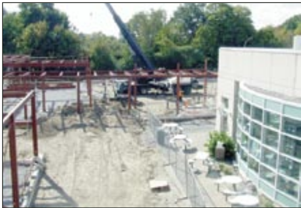
Birthing and Newborn Centre at Rouge Valley Centenary