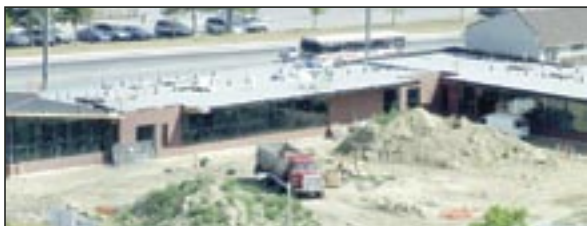
Phase II Mental Health Supportive Housing at Rouge Valley Centenary