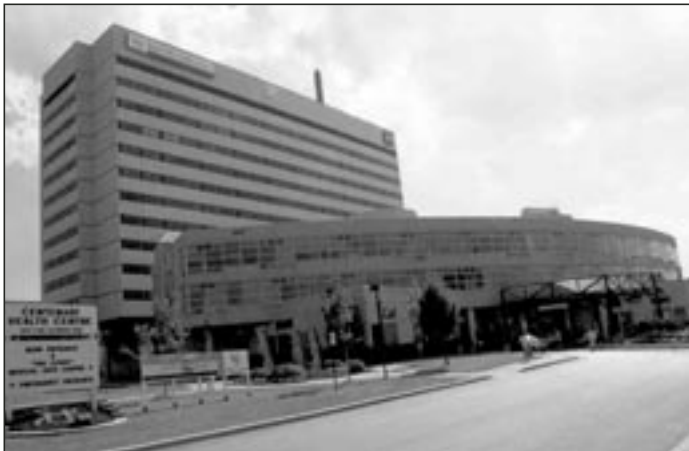
Rouge Valley Centenary

2867 Ellesmere Rd, Scarborough, ON M1E 4B9 (416) 284-8131