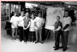
Give a Gift from the Heart booth at Scarborough Town Centre