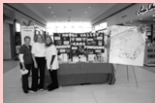
Give a Gift from the Heart booth at Pickering Town Centre

Visitors also learned about the Cardiac Care Program and ways in which to be proactive with their heart health.